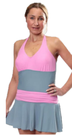
Kes-Vir Ladies Skirt Swimsuit (halter neck with waterproof swim pants)