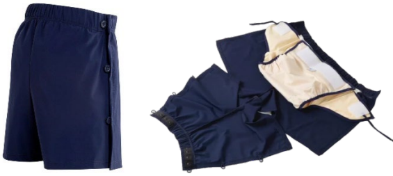
Kes-Vir Boy's Wrap Swimshorts