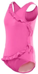
Kes-Vir Waterfall Swimwear (wrapover swimsuit with waterproof briefs)