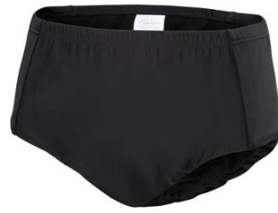
Girl's Swim Briefs