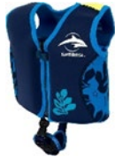
Konfidence Jacket Premium Swim Vest for Kids

If you would like to buy your own jacket these, and other specialist swimwear products, are available on Amazon. Some of the swimwear retailers mentioned above also sell different versions of swim vests and toddler wetsuits.