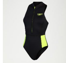
Speedo Women's Sleeveless Thermal Swimsuit